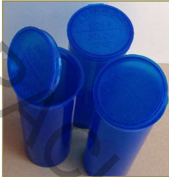
PHOTO: PSt 60 Container

CONTAINER: 100% recyclable polypropylene